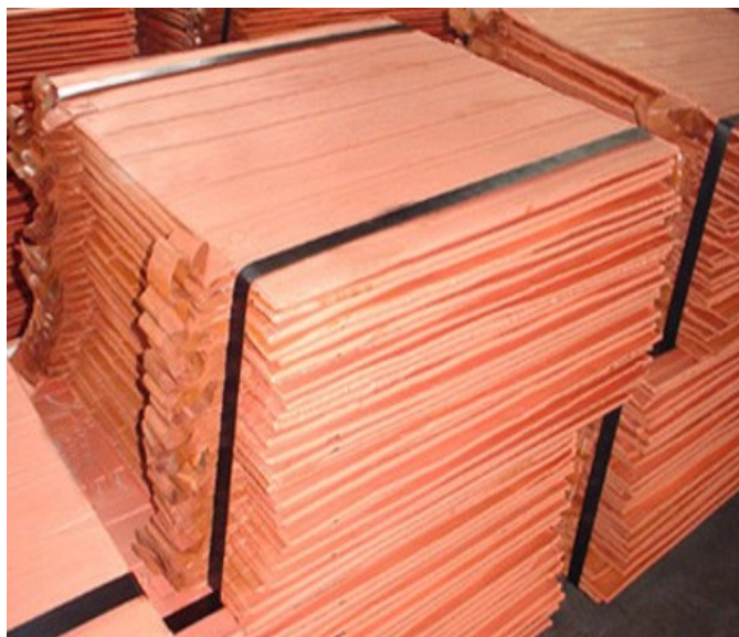
Figure 5: The Province invites Investment in Copper Mining and Minerals Processing

The Province is rich in several minerals – copper, iron, gold, uranium, cobalt, and manganese, to name but a few.