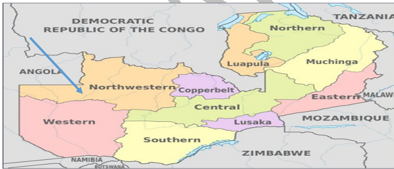
Figure 1: Location of North Western Province in Zambia

North Western Province is not only home to the source of the great Zambezi river sitting on the rugged hills of the Kalene Hills, but it has several rivers that provide picturesque landscape that could be tapped for various investment in tourism. The rivers have also nourished the plains suitable for livestock grazing and cultivation of rice and vegetables for commercial purposes. At the same time, the province boasts of less tampered with forests of indigenous trees. “