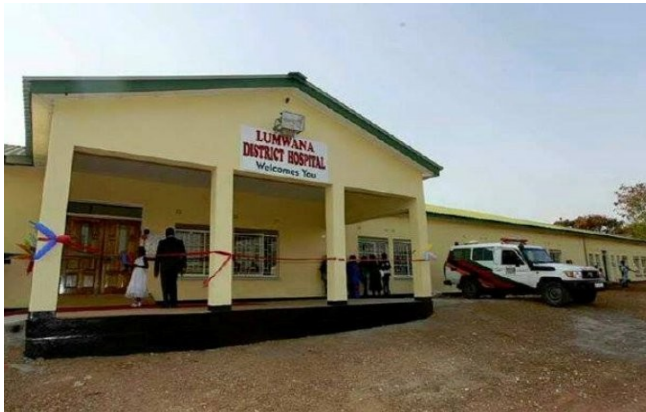
Figure 7: Lumwana District Hospital commissioned in 2015