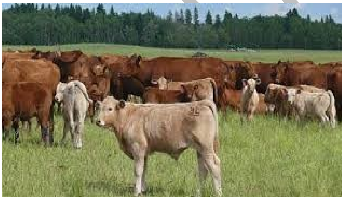
Figure 2: Investment Opportunities in Livestock Development

The Vast grasslands across the province create an immense opportunity for investment in cattle ranching, piggery, ruminants and dairy.