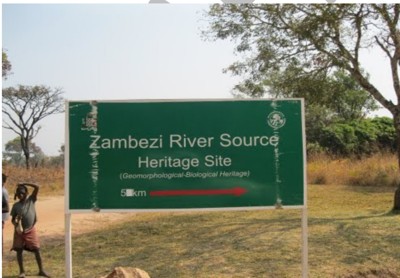
Figure 6: Zambezi River Source - One of the Major Heritage Site in the Province

YOU HAVE HEARD ABOUT IT. GO SEE IT FOR YOURSELF TO APPRECIATE IT!