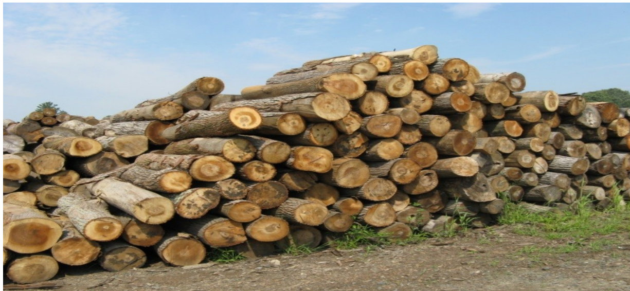
Figure 3: The Province supports sustainable exploitation of Forest Resources