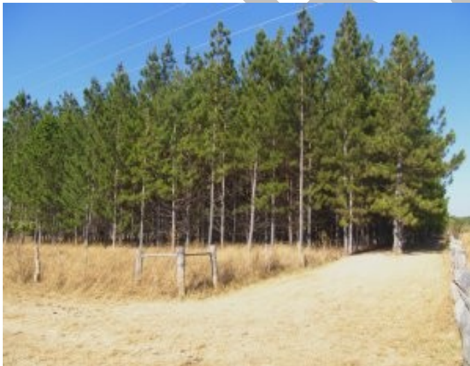
Figure 4: The Province welcomes Investments in Pine and Eucalyptus Plantations

The province supports the production of timber, honey and other forestry products, in the above-named districts and further recommends the following: